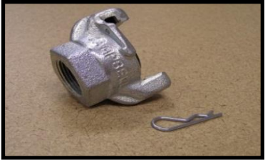
3/4 FNPT 2 lug fitting for 185's, 60 & 90 Lb breakers w safety pin.