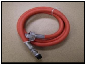
1/2" Hose No Oiler