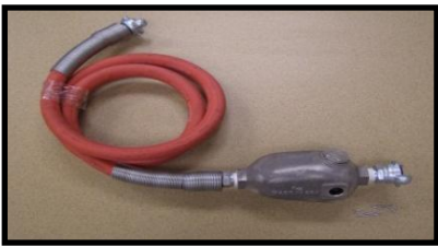
1/2" Hose With Oiler