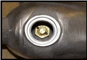
Internal oil flow adjuster