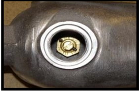
Internal oil flow adjuster (w manual relieving safety fill caps)