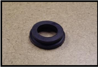
Gasket for 2 lug coupling.