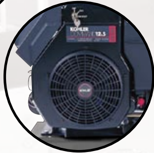
12.5HP Kohler Engine with Electric Start and Alternator