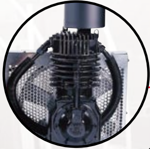
Rugged Two-Stage CAST IRON Pump