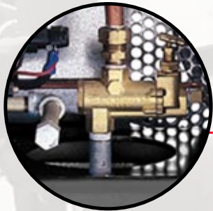
Pilot Valve Control Automatically Idles the Engine