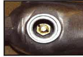
Internal oil flow adjuster (w manual relieving safety fill caps)

Breaker Latch Replacement kit Contains Latch, bolt, spacers and spring