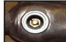
Internal oil flow adjuster