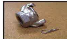
3/4 FNPT 2 lug fitting for 185 and 60 & 90 Lb breakers w safety pin.