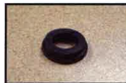
Gasket for 2 lug coupling.